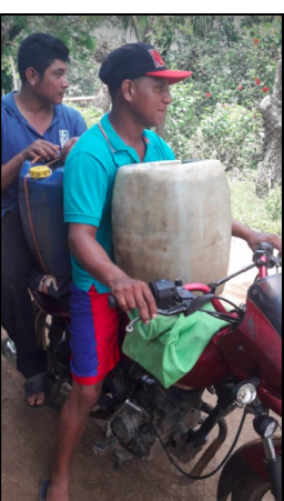
Chacocente is sharing water with families from the surrounding neighborhood.