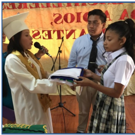
PASSING THE FLAG

We are thrilled that six girls and two boys earned their high school diploma this year. Despite the suspension of classes due to political unrest, our teachers worked diligently helping students throughout that period and once classes resumed assuring that when possible they could catch up and graduate.