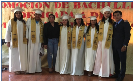
GRADUATING CLASS OF 2018

We are thrilled that six girls and two boys earned their high school diploma this year. Despite the suspension of classes due to political unrest, our teachers worked diligently helping students throughout that period and once classes resumed assuring that when possible they could catch up and graduate.