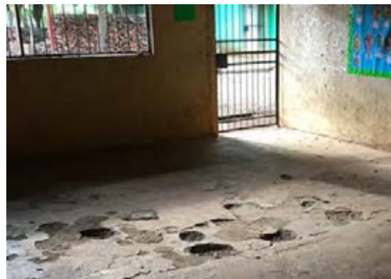
The floor in one of our elementary classrooms